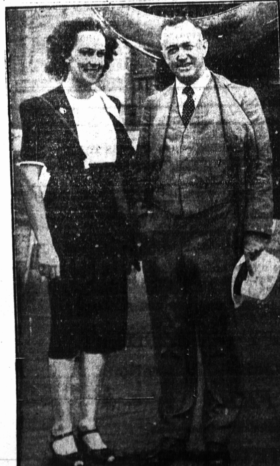
LINCOLN Ellsworth, shown here with his wife, is testing the powerful airplane in the background for an Antarctic expedition. He will leave at the end of the year for the Enderby Quadrant, the last unexplored part of the world. Tests are being carried out at Floyd Bennett Field, Brooklyn.