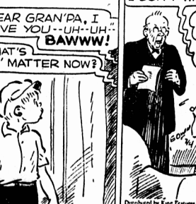
TILLIE THE TOILER