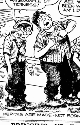
BRINGING UP FATHER