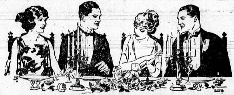
Note how teeth glisten everywhere today

Parisian Corset Manufacturing Co. Limited Montreal QUEBEC Toronto "P.C. Corsets" GUARANTEED