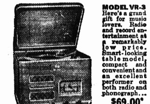
MODEL VR-3 Here's a grand gift for music lovers. Radio and record entertainment at a remarkably low price. Smart-looking table model, compact and convenient and an excellent performer on both radio and phonograph... $69.00