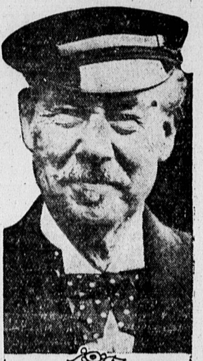
Sir Thomas Lipton, famous Irish sportsman, has presented a cup, to be known as the "Lipton Trophy," for the sea flea races at the Canadian National Exhibition.