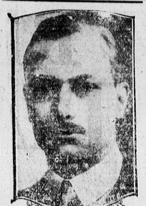
H. R. H. Prince Henry, Duke of Gloucester, broke his collar bone in a fall during a polo game at Vancouver on June 4. Doctors state that the fracture will knit perfectly and that his royal highness is resting easily.