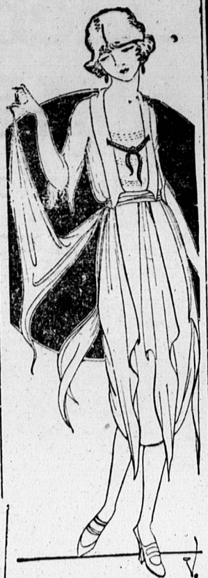
Easy to Fashion

Organdy and taffeta are combined in many chic frocks. Sometimes the underneath frock of taffeta will be draped with organdy in contrast color.