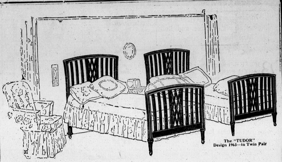
The "TUDOR" Design 1963—in Twin Pair