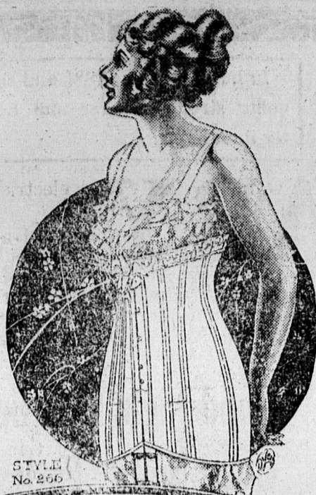
STYLE No. 256