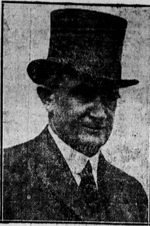
SURGEON WEARS HIGH HAT CROSSING THE ATLANTIC

"Iodine is almost an absolute preventive of colloid goitre," he said. "That has been proved beyond all question. In those countries like Switzerland, the Indian Punjab and our own western and Great Lake region, where the water is deficient in iodine, goitre abounds. There is little of it, for example, in the states bordering the Atlantic coast and where great quantities of sea food are consumed. How we manage to extract the iodine from food, no one knows,