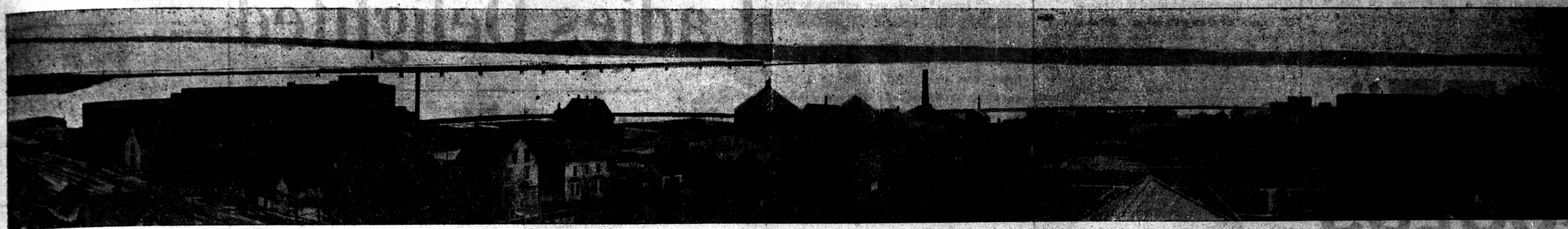
THE RAILWAY AND GENERAL TRAFFIC BRIDGE ACROSS HILLSBORO RIVER NEAR CHARLOTTETOWN.