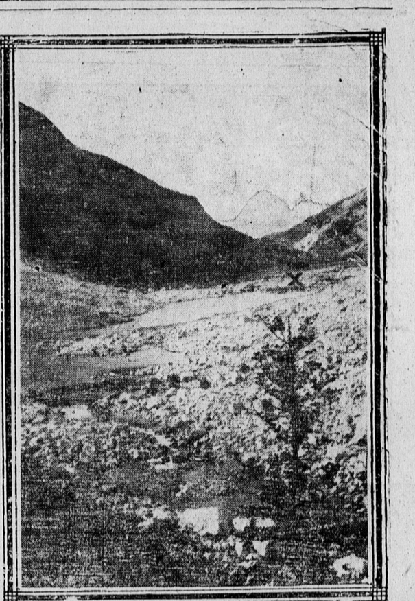
In the middle of the night, April 29-30, 1903, a mass of rock weighing millions of tons broke away from the summit of Turtle Mountain (7,236 feet) in the Crow's Nest Pass, Alberta, and swept away a large part of the mining camp of Frank as though it were matchwood. Eighty miners, their wives and children, sleeping beneath the avalanche, were carried away into oblivion. The mass of rock covered over a square mile of the valley, shown above. The cross indicates about where the centre of the town of Frank stood in 1903. Following a government investigation in 1910, the remainder of the town was ordered moved out of an indicated danger zone. It was feared that another large section of the mountain peak might fall. This has not yet happened, but if it does, the C. P. R. track from Macleod and the Red motor trail will again be in peril.