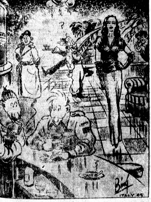
"C'mon - C'mon—A Puss like your 'ruin his career!'"