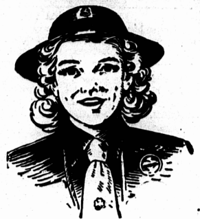
OUR GIRL GUIDES OF LENNOX ISLAND