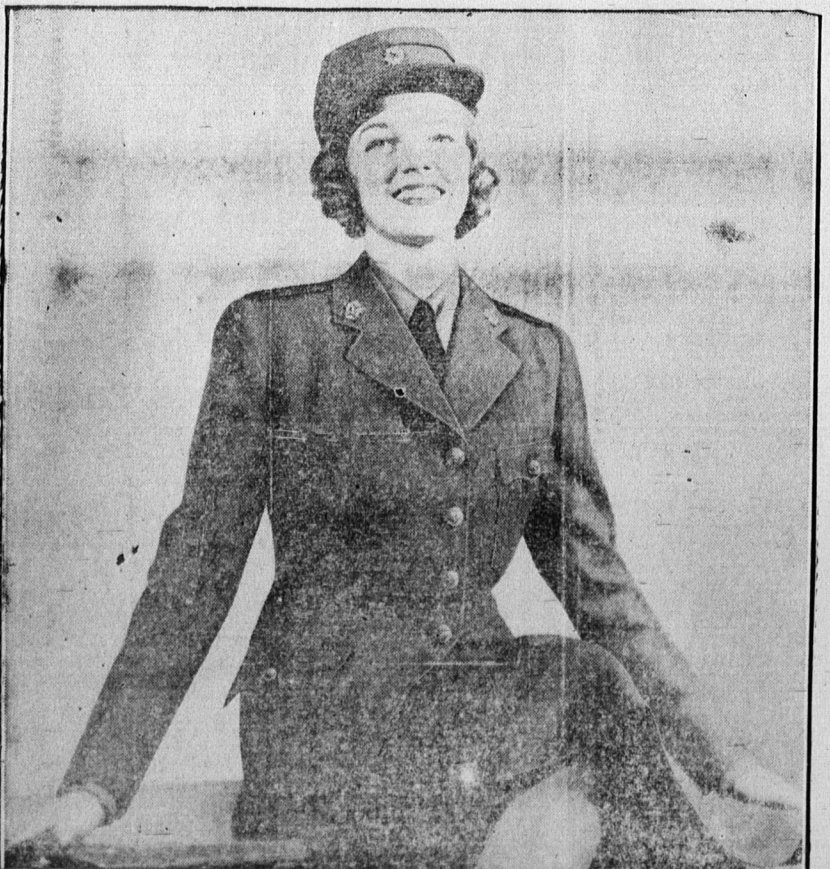
Here is one of the first official pictures of the Canadian Army Women's Corps uniform. Made of barathea, the uniform has beech brown shoulder straps to make a smart contrast with the khaki and is styled on the fitted lines of the new "long torso" design.