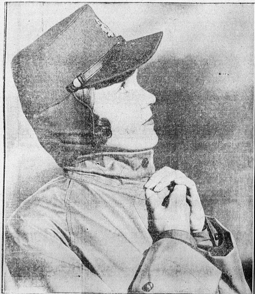
All set for windy storms is this Volunteer of the Canadian Women's Army Corps. She has folded down the back of her "kepi"-style cap so that it fits snugly under the collar of her issue raincoat. This arrangement is one of the smart innovations that make the C.W.A.C. uniforms stylish as well as serviceable.