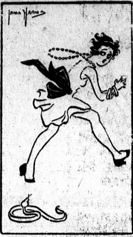
Those who believe that germs multiply are naturally suspicious of an adder.