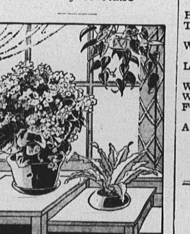
Begonia Likes A Coolish Window

What a thrill to raise an exquisite, healthy begonia—a thrill you may have despaired of having! But, like other plants, the begonia will flourish with just a little of the right care.