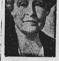
THE ART OF CONVERSATION