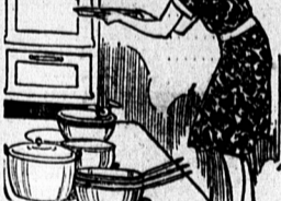
ALL THE KITCHEN UTENSILS