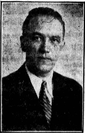
HON. THANE A. CAMPBELL