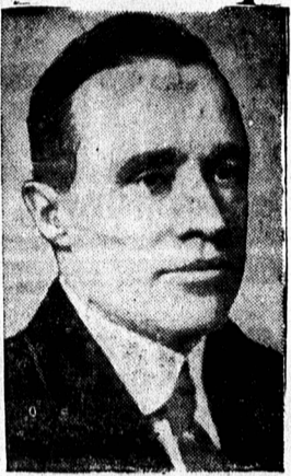
HON. JAMES G. GARDINER