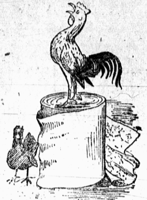
We Crow Over All.

DOES YOUR PEW FLOOR look as well as your parlor floor? We think not, but it ought to be and we are going to give you the chance to make it look as well. We have a lot of short ends of carpets in 3 to 4 yard lengths and some slow sellers, not the prettiest patterns in the world but real good quality that we are going to PRICE and offer for the next WEEK or TWO. You may think that they are OLD VOTERS when you see their price, but we can assure you they are this year's import and have no other qualification other than A 1 value.