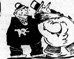
Beggar: Beg pardon, sir, but I've seen better days, sir. Mr. Krusty: So have I lots of 'em. This is the worst weather I've struck in five years.