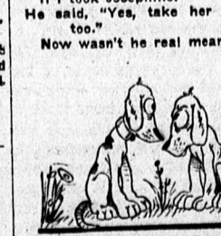
"Where is old man Cur-haven't seen him for days." "Oh, he got so old and puppish, they sent him to the home for indigents."

HE WAS I asked her father if he cared if I took Josephine. He said, "Yes, take her mother, too." Now wasn't he real mean?