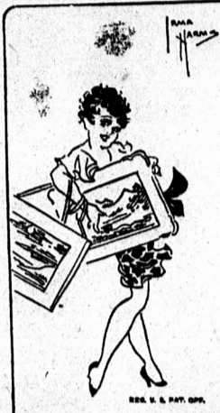
"One may not like moving pictures, but it's easier than moving pianos."