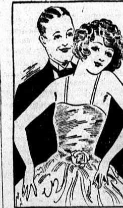
"Bacilli are invisible." "Right you are. At least, those in kisses are simply out of sight."

HE WAS I asked her father if he cared if I took Josephine. He said, "Yes, take her mother, too." Now wasn't he real mean?