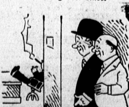
"What's the reason DeSwitt doesn't apply for a divorce?" "Why his wife has taken to moon splaining and he thinks he might as well wait."