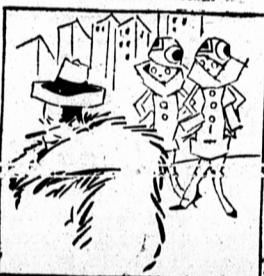
Betty: He's very narrow. Boss: What do you expect of a flat?