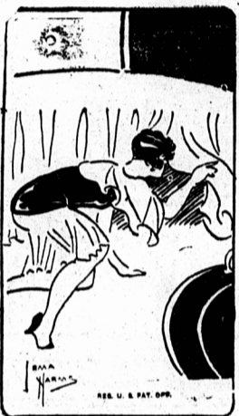
"When one loses a leather grip it's a case of hide and seek."