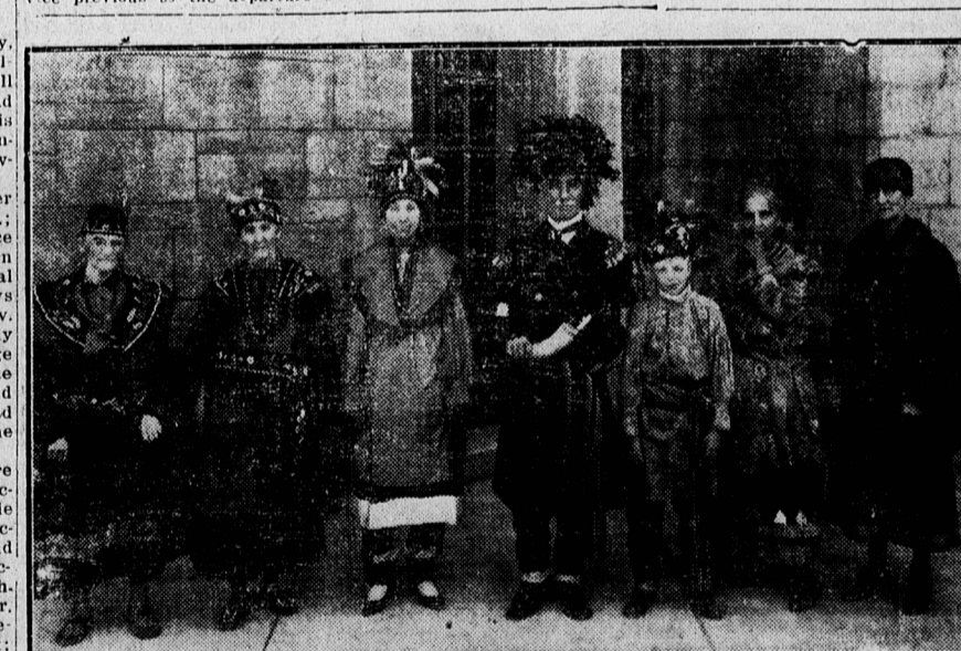
A band of Lorette Indians presented a picturesque appearance at the recent Quebec folk-song and handicraft festival. They are the half-breed descendants of the ancient Hurons and Wyandots discovered by Champlain and Sagard near what is now Georgian Bay, Ontario, and evangelized by Brebeuf, Lallemant and other early Jesuit martyrs. The Lorette people live on a tiny reserve eight miles northeast of Quebec. They are one and all skilled and industrious craftsmen and trappers, and still remember a few of the nativesongs and dances.

The deceased was beloved by all who knew her. Her kindly feelings and loving disposition were the memory of one who was loved and remembered by all.