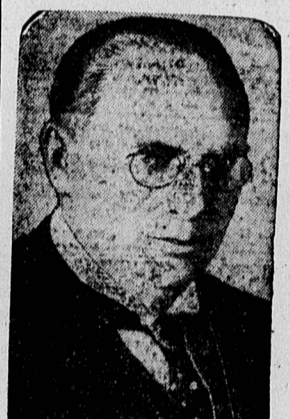
RT. HON. R. B. BENNETT Prime Minister of Canada and Chairman of the recent Imperial Conference who will make formal announcement next week of Canada's treaties with Empire countries.