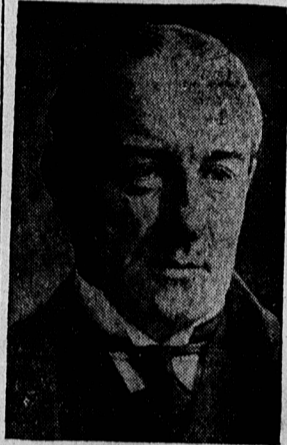
RT. HON. STANLEY BALDWIN Lord President of the Council and Leader of the Conservatives in the British House of Commons, who yesterday warmly defended agreements concluded at the Ottawa Economic Conference.

Regrets Nothing That Happened At Conference