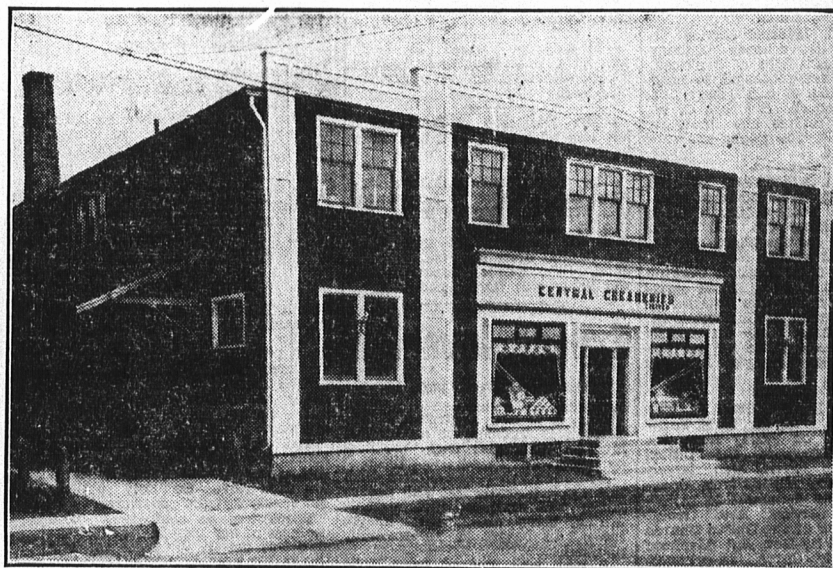
Central Creameries Office and Plant, Charlottetown

systems in the province was installed. Dominating the policy of the Company since its birth has been its insistence on modernity. Both the Summerside and Charlottetown branch are completely equipped with sprinkler system for fire pre-