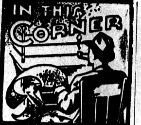
The executive of the senior City Baseball League will hold a meeting tonight when team managers will report on their respective club rosters.