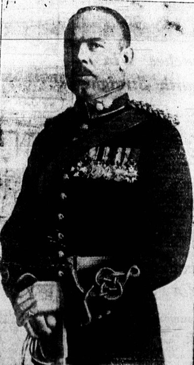
throughout the last war. He became R.M.C. commandant in 1925. He has commanded three military districts, the last being at Halifax. There he welcomed Premier King during the latter's inspection tour. The general can be seen in the LOWER RIGHT of the picture at LEFT, as the prime minister examined an anti-aircraft gun only a few days ago.