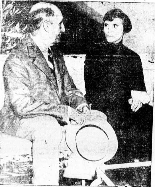
The Empress Zita of Austria is now a war visitor of Canada. While Canada is busy with an Austrian paperhanger the empress of that ancient and glamorous empire of Austria moves as a guest of the sister of St. Joan of Arc into a lovely elusive little old chalet made of wooden squared timbers, next door to Spencerwood, home of Quebec lieutenant-governors and one good golf drive from the path up the hill which James Wolfe took with his Highlanders a couple of centuries ago. The empress is seen with a U.S. host.