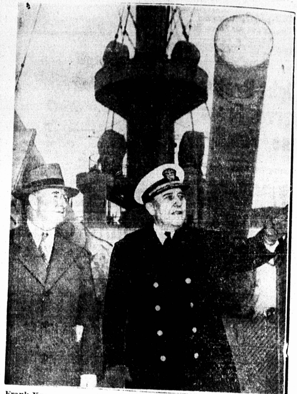
Frank Knox secretary of the navy, said that the United States needs more Pacific bases, "and we will have them." "How far-flung these bases must be awaits the outcome of events now in the annual forum on current problems. Knox said this war was again proving the world's "The contestant who control the high seas control the destinies of the world." "The contestant who control the high seas control the destinies of the world. Only possession of sea power which denies a crossing of the English channel to the immense land forces of the Germans, the allied British air power, outnumbered probably four to one, to make that magnificent defence."