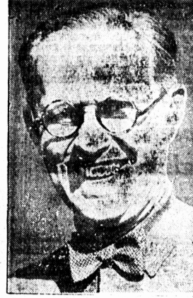
ON WAY HOME