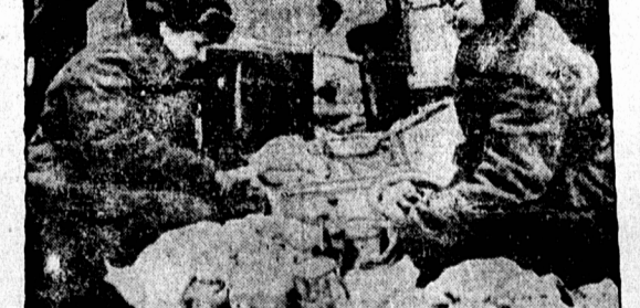
PRESENTS FROM HOME! Like winter, Christmas comes early on this Russian front, where three women soldiers, foreground, and their men comrades, behind, open boxes of food from home.