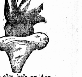
Or else he's an Ass

This powder acts as a preventive and conditioner in some cases cures disease. For horses that are run down and bad coated it works wonders and will put them on their feet quicker than any other. In cases of poor feeders it acts like magic; starts them eating almost at once, and when they eat they do work and are all right. For stallions it is particularly efficacious and you will find that your horse will be more vigorous and in better condition to go into a season and will prove to be a surer foal getter by 20 per cent than before. For colts and brood mares it will convince you that it is a good investment for it will keep the colts healthy and in show shape all the time and will carry them through the winter in better condition and with less feed than ever before. For mares in foal you will find it beneficial as it will keep them in a natural robust condition and they will be in shape to raise a strong colt when the time comes. Price 2 lb. Box 70c. Nicholson's Pony Health 2 lb. Box 70c. Nicholson's Pony Health 3 lb. Box 1.00. You get 25c. extra from each box. All put up fresh as ordered and all delivered free if you mention this paper. Can supply any quantity. Send money order for what you want or when in Charlottetown call and buy a Box.