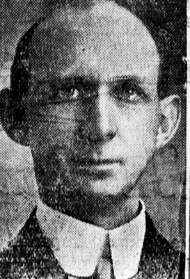
Newly elected member for West Middlesex, who will move the address in reply to the speech from the throne at the opening of Parliament this week.