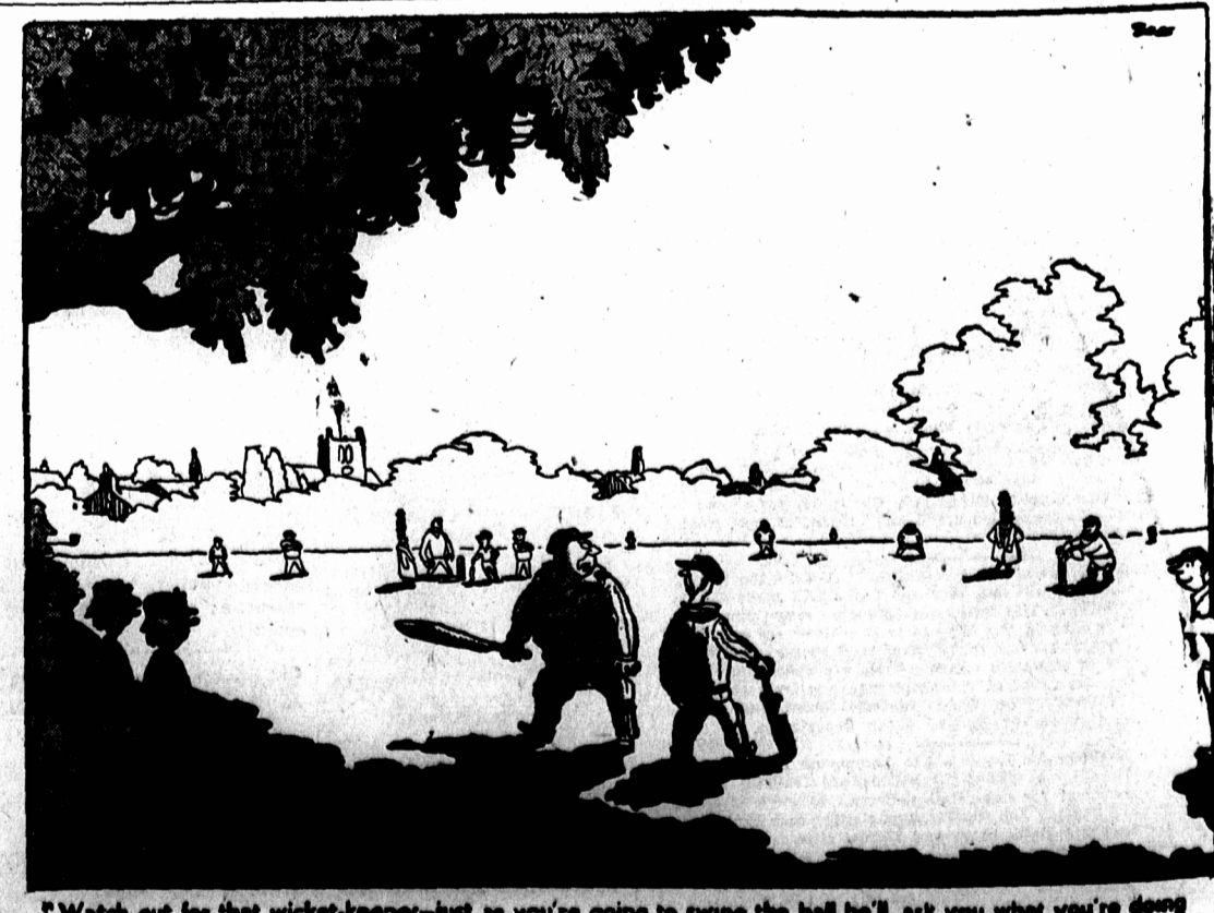
"Watch out for that wicket-keeper—just as you're going to swipe the ball he'll ask you what you're doing here instead of working to speed production or something."