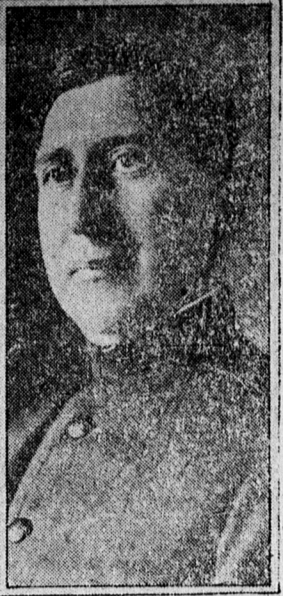
NEW ENGRAVING BUREAU HEAD