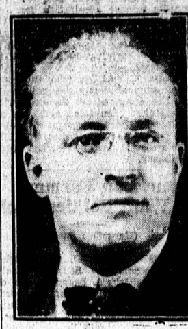
Hugh Walpole, English novelist, now in New York, who declares that Rev. Dean Inge "makes a specialty of attracting attention by constant hysterical pessimism," and that little attention is paid by the old land to his "gloomy forebodings."