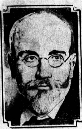
Eleutherios Venizelos, former Greek premier, who is reported as being definitely through with politics.

FOR SALE OR TO RENT—Cottage No. 116 Brighton Road, furnace heated, with bathroom equipment all in good condition. Apply 134 Kent St. 2022-10-12-31