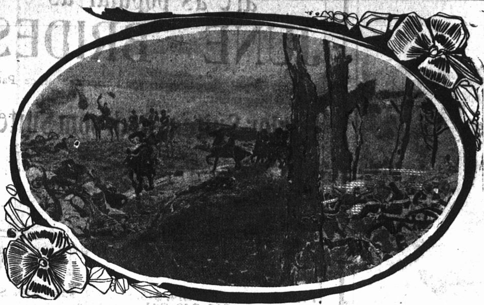
ARTILLERY BATTLE BEFORE NAN SHAN HILL WAS REACHED.