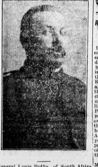
General Louis Botha, of South Africa.