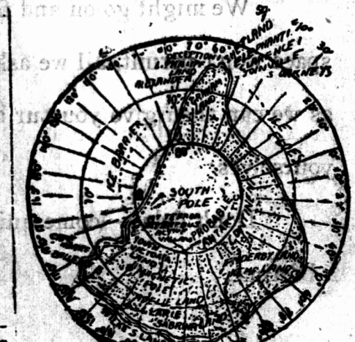
MAP OF THE ANTARCTIC CONTINENT.

Captain R. F. Scott, who commands the expedition and who will remain another year in the Antarctic regions to continue the work which