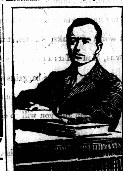
CAPTAIN R. F. SCOTT.

The relief party found the Discovery on Jan. 23 in MacMurdo Bay, Victoria Land. The expedition wintered 400 miles farther south than any vessel had previously done, and Captain Scott, with Dr. Wilson and Lieutenant Shackleton, penetrated