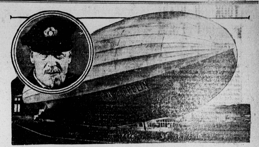
The Graf Zeppelin, which was forced to abandon its transatlantic flight because of engine-trouble. Inset credited to abandon its transatlantic flight Dr. Hugo Eckener, her commander.