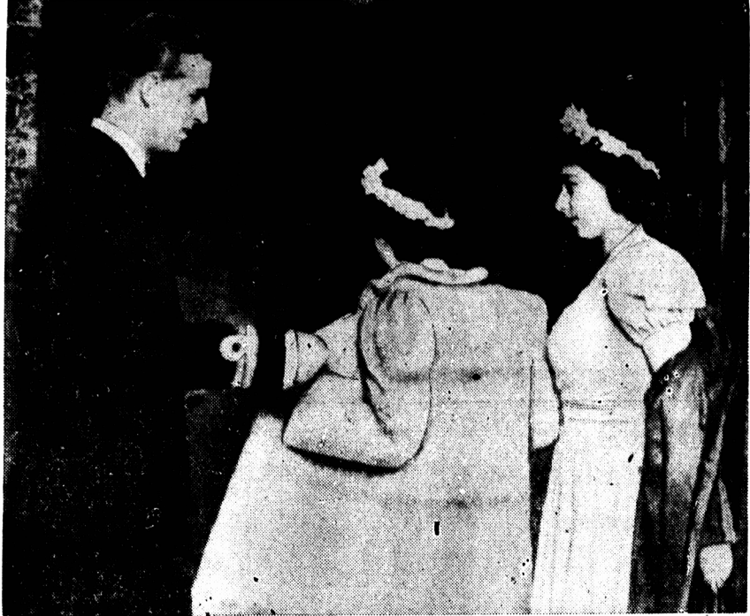
Prince Philip of Greece, rumored about to be engaged to Crown Princess Elizabeth (right) of Great Britain, helps Princess Margaret Rose remove her wraps at Romney Abbey where all three were guests at the recent Mountbatten wedding...