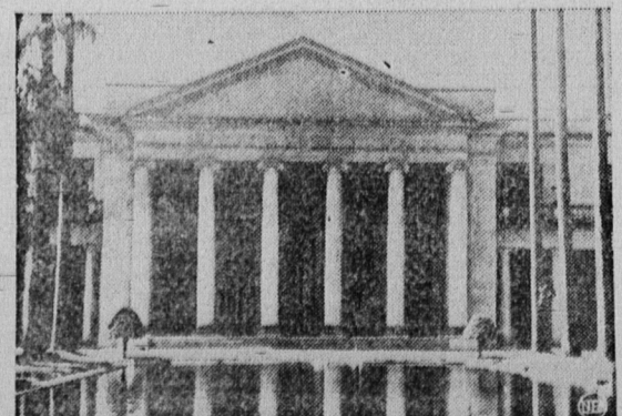
Foreign ministers of the American republics will meet in the Palacio Itamariti, above, in Rio de Janeiro beginning Jan. 15 to strengthen ties of hemispheric defense. Undersecretary of State Sumner Welles leads United States delegation.

Several thicknesses of newspaper spread on the plate-rack over the stove will absorb the moisture from cooking and prevent the kitchen getting steamy.