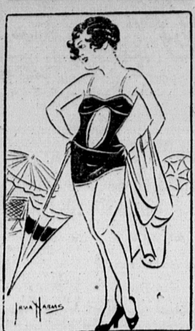
"A girl with a limited wardrobe can often make a better showing than one who is too well dressed."