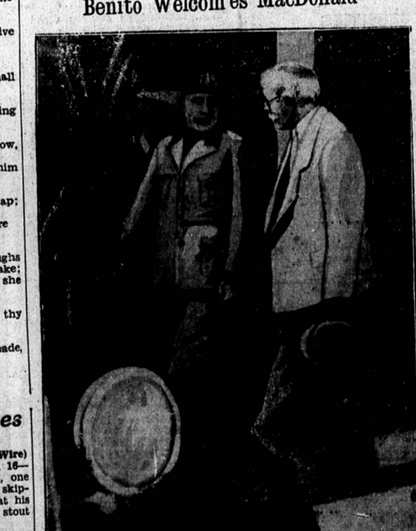
This photograph, sent by telephoto and radio from Stess, Italy, shows Premier Benito Mussolini, of Italy (LEFT) escorting Premier Ramsay Macdonald, of Great Britain, from his hotel as II Duce's personal bodyguard protect the two statesmen at the conference. The tripartite conference of Italian, English and French statesmen, seeking a paritite conference of Italian, English and French statesmen, seeking a means of relieving Europe from the threat of war, is in session on the island of Isola Bella, in the famed old Castle Borromeo. Europe expects that this gathering will be but a forerunner of several such conferences, the later ones to include Germany and other nations of Europe.