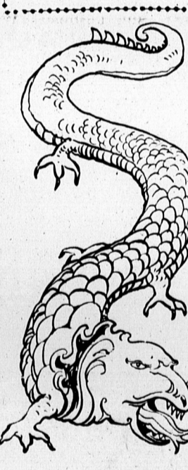
THE PRIZE AT LAST