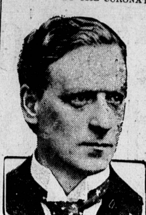
Hon. H. H. Asquith, Premier of Great Britain.