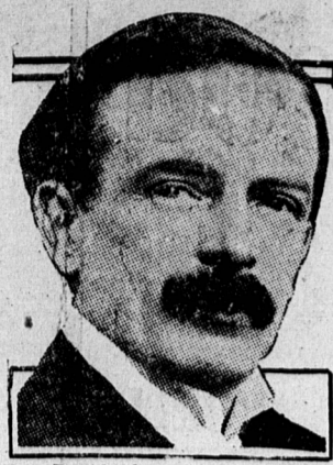
Hon. David Lloyd-George, Chancellor of the Exchequer of the United Kingdom.