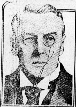
Hon. Joseph Chamberlain, England's Greatest Imperialist.