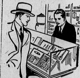
THE RIGHT PLACE!

The epidemic of whooping cough is abating in our locality. It has been very severe in many cases but no fatalities are recorded thus far for which we have reason to be very thankful as it affects all ages and in the case of young children has been a severe trial to the parents.—W.