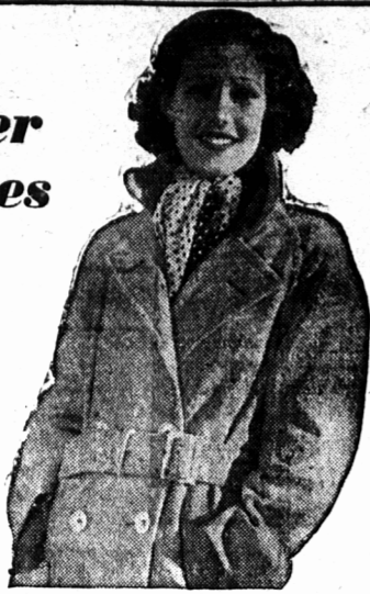
LORETTA YOUNG—First National Pictures star

DROP in at a restaurant or come back home—and treat yourself to a perfect late snack. It's a bowl of crisp Kellogg's Corn Flakes, with milk and a bit of fruit. Delicious! Easy to digest. Helps you sleep sounder. Just try it instead of something heavy! Quality guaranteed.