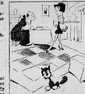
JUST NATURALLY HARD

1st Bird: Girls are dressing more sensibly now. 2nd Bird: Yes, they're not trimming their hats much with feathers any more!