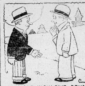
NE MORE WOULD'NT COUNT

"I'll attend your church if there wasn't such a bunch of crooks in the congregation." "You shouldn't let that stop you—one more wouldn't be noticed, I'm sure."