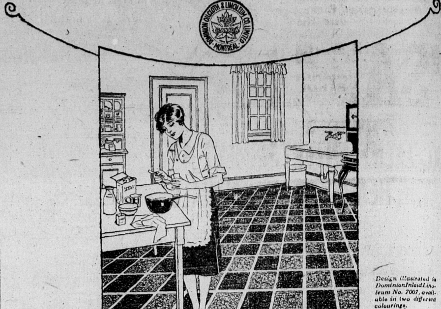
Enduring Wear Just Where It's Needed

For the woman who is a lover of fancy china we have just what will please her. We have just received a shipment of fancy china and colored glass, suitable for bridge prizes and wedding gifts. An assortment of coloured glass in bon bon dishes, cake plates, etc., can be seen in one of our show windows. We will take great pleasure in showing you this line, and we feel sure you will find something to please you. W. W. Wellner Ltd. JEWELERS SINCE 1868