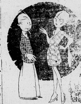
She: The modern girl has a lot of latitude in the matter of dress. He: Yeh—and not enough longitude.

"I'll attend your church if there wasn't such a bunch of crooks in the congregation." "You shouldn't let that stop you—one more wouldn't be noticed, I'm sure."