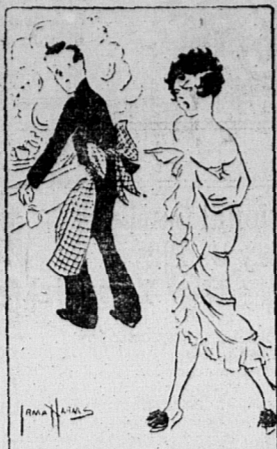
"When a man is in his cups he's usually in hot water."