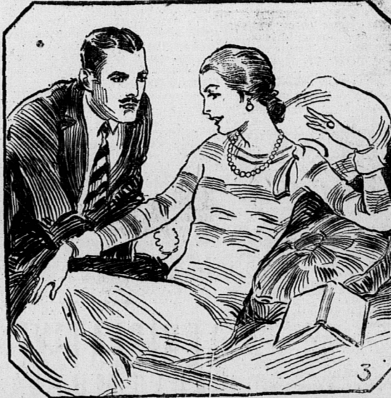
For an instant there was some think in Elinor's eyes that recalled to Tony the picture of Saint Joan seeing visions.

The situation is this:—DAN CARVER, deceased, who adopted Millicent and Elinor when they were children, had been in love with Tony's mother in his youth. Becoming eccentric as he aged, he was obsessed with a desire to have one of the girls married to Tony. In his will he had stipulated that the bulk of his estate is to go to the one who becomes Tony's wife. The other is to receive a small allowance for life. And it is Millicent who is in love with Tony. But Tony loves Elinor and is glad of an excuse to propose to her, having done so twice before. She rejects him and tells him he must marry Millicent.