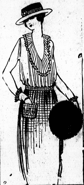
Tailored Blouse of Creps Meteor.

and certainly high necked garments, whether blouses or frocks, have not "taken" in the American market for years.