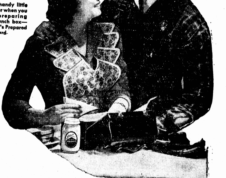
The handy little helper when you are preparing the lunch box—Libby's Prepared Mustard.

Your grocer is featuring Libby's Prepared Mustard this week. Put Libby's on your next shopping list... so you'll be sure to have that helpful little jar to put on your table.