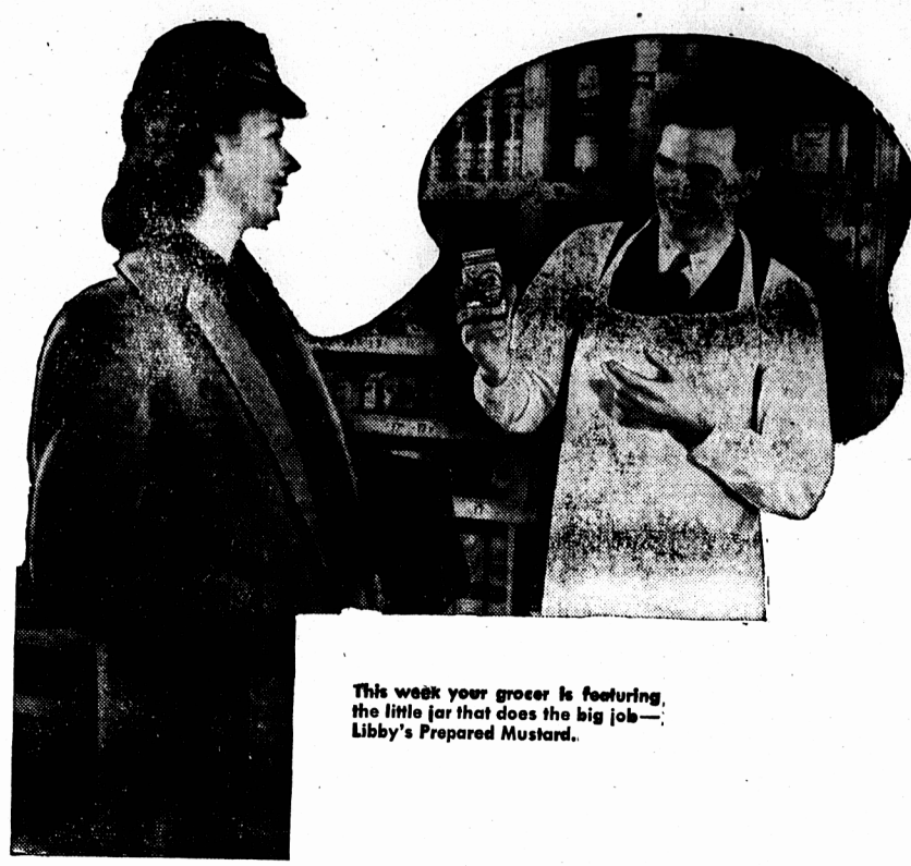
This week your grocer is featuring the little jar that does the big job—Libby's Prepared Mustard.