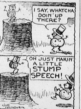
"I say, whatcha doin' up there?" "Oh just makin' a little stump speech!"