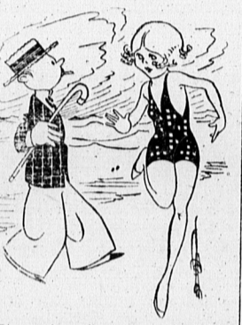
She: Are there any sharks in these waters? He: Yes, but they're so tame they'd eat off your hand.