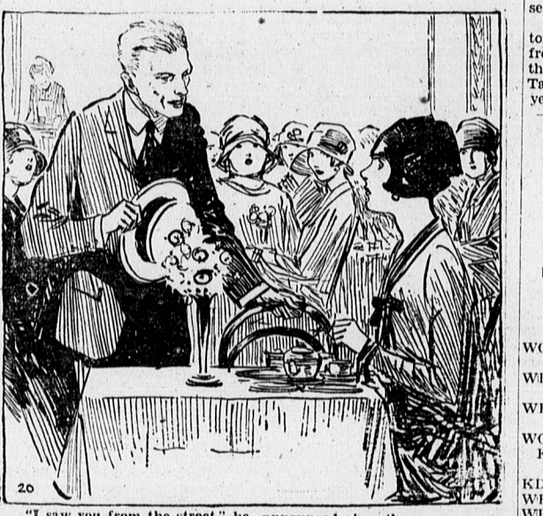
"I saw you from the street," he announced abruptly.

... cynical about the obvious change in her social status. She was grateful—but there was nothing in her simple, unaffected manner of receiving these salutations to suggest that she was in the least flattered by them. She acknowledged them with a pleasant bow and a smile, but offered no further encouragement to those who seemed to want to join her, or to ask her to share their table. Just as she was about to leave, a young man strode into the shop and crossed directly to her. "I saw you from the street," he announced abruptly, and seated himself without waiting for permission. Norma's clear cheeks flushed, and a little, annoyed sparkle came into her blue eyes. The man was an employee in the bank at which her father did business. "Really, Sydney, you're as sudden