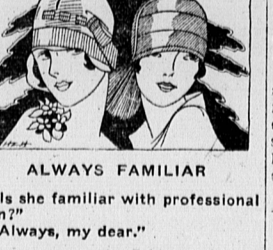
ALWAYS FAMILIAR "Is she familiar with professional men?" "Always, my dear."