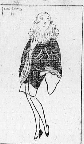
"A girl sometimes does get credit for looking smart, if her tailor suit."