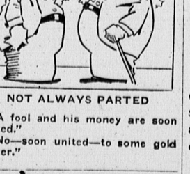
NOT ALWAYS PARTED "A fool and his money are soon parted." "No—soon united—to some good digger."