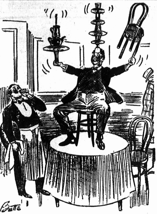
The customer is always right. — London Opinion.