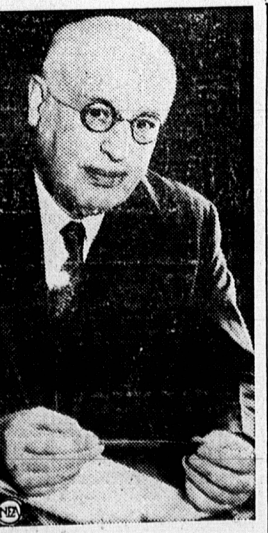
Alberta's disciple of Social Credit—Premier William Aberhart, three years, no credit.

The Alberta legislature in 1935, and his government, pledged $3 the Social Credit plan of Major Clifford H. Douglas. Scotch economist went to work at the beginning of 1936.