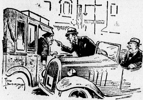
Taxidriver (after wordy battle): "Orrright, orrrright! Take the 'L' down, mate, you ain't got nothin' to learn." —Humorist.