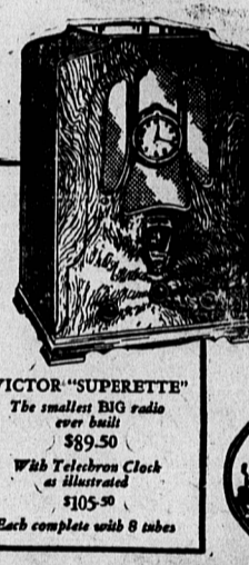
VICTOR "SUPURETTE" The smallest big radio ever built $89.50 With Telephon Clock as illustrated $105.50 Each complete with 8 tubes

for performance ... cabinet beauty... quality... today's most striking value... $122.50 Complete with Tubes