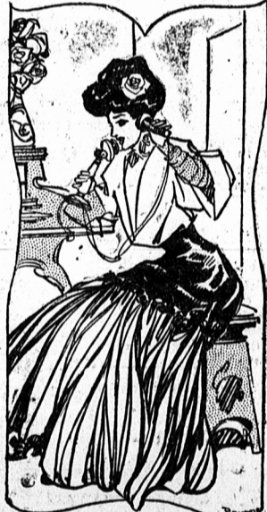
SHE WAITED IMPATIENTLY FOR CENTRAL TO GET THE NUMBER.

"Men have no curiosity," she sighed happily, "and no imagination. They lose a lot of fun."