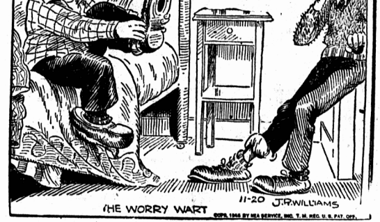
THE WORRY WART